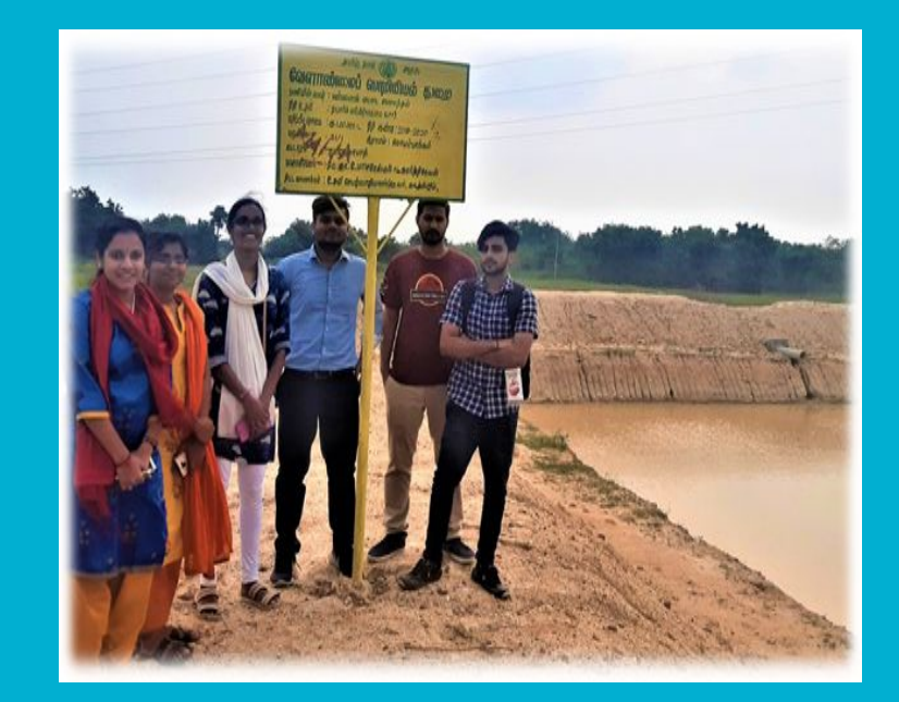
Watershed projects, Cholavaram village, Kanchipuram

Agriculture Joint Director Office, Kanchipuram