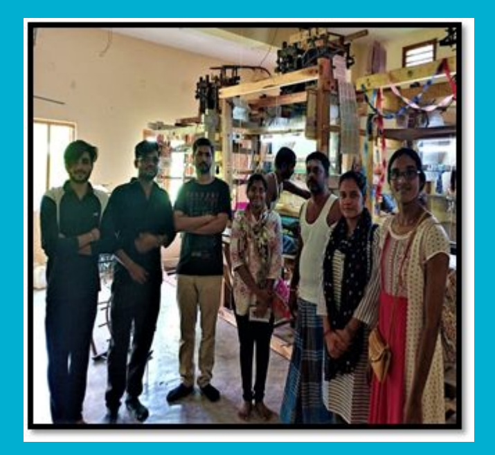
Weaving community, Chittathoor, Kanchipuram